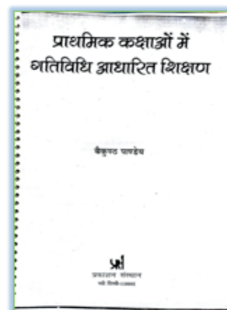
Distributed ABL guideline