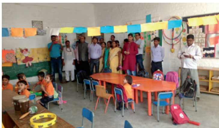
Teachers during the exposure visit at Takshila school

Third, Deshkal Society invited 52 teachers from K. Nagar block to visit the Takshila school at Bodh Gaya from the 1st May to the 3rd May to gain more experience with ABL. The visit, which included 25 female teachers and 13 SC teachers, was to further expose teachers to ABL methods by means of demonstrations. Additionally, the visit also served to show the system of SMART classes and awareness about the history and heritage of the state. At first, classroom observations