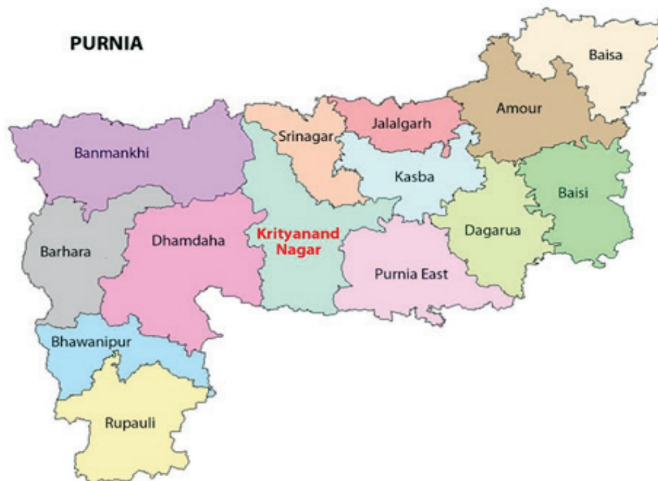
Map of the block Krityanand Nagar in district Purnia