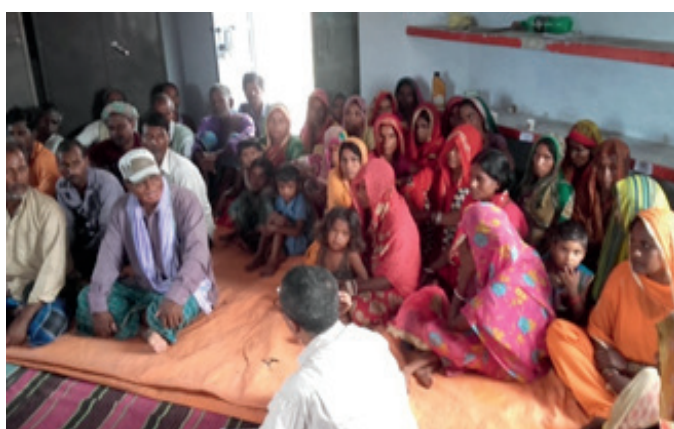
Parents voicing their opinions

Parents-Teachers Meetings (PTMs) were initiated as soon as it became clear that there existed a very strained relationship between the parent and teacher community of the project area. At the root of these strained relations, was the mismanagement of expectations from both sides. Hence, Deshkal Society implemented these activities with an eye to fostering a more positive relationship between the teachers, parents and community members by involving the latter two stakeholders in the