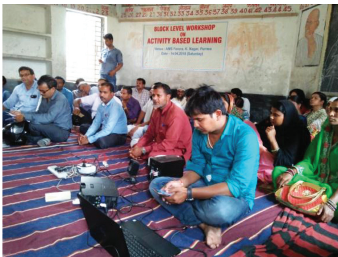
One of the block workshops at AMS Parora

effective and entertaining engagement in the classroom; (2) the aspiration of society is growing and the government education system experiences the pressures of expectations with regard to delivery; and (3) when teachers are able to give their best, the enthusiasm and interest of the parents and community members was also enhanced.