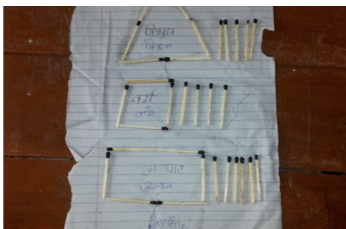
A student's improvised and self created ABL tool

Right from the beginning, the project aimed to employ the ABL process and its tools as a novel and game changing method to replace monotonous rote learning classroom performances on three counts. First, the project was geared towards largely replacing the traditional method of passive learning by active and energised forms of learning which allow children to be at all times involved in the classroom proceedings and continuously discover,