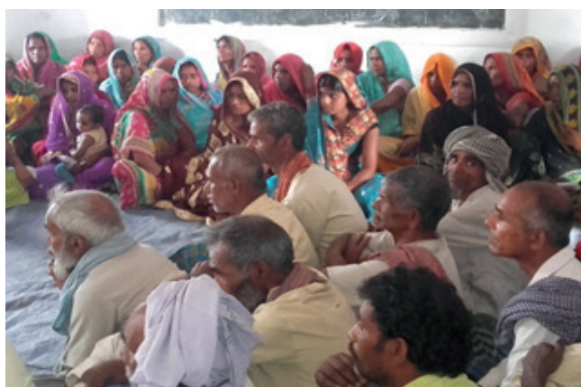
A PTM gathering

The PTM has been an important site for interaction between parents and community members on the one hand, and teachers, headmasters and CRCC on the other. During these meetings, these stakeholders gather information on the proceedings of the educational activities undertaken at school as well as at home. Parents and community members are briefed about the good results that students and schools achieve and also about the problems that they face. Teachers, headmasters and CRCCs also elicit information from parents about the students' activities at home and in the community. In the past, most of the schools faced many challenges in organising PTMs on a regular basis. Deshkal Society has been able to help schools in organising well-attended PTMs. The society's staffs not only encouraged headmasters to organise PTMs, but also visited parents and responsible community members at home to invite them to attend PTMs whenever they were organised.