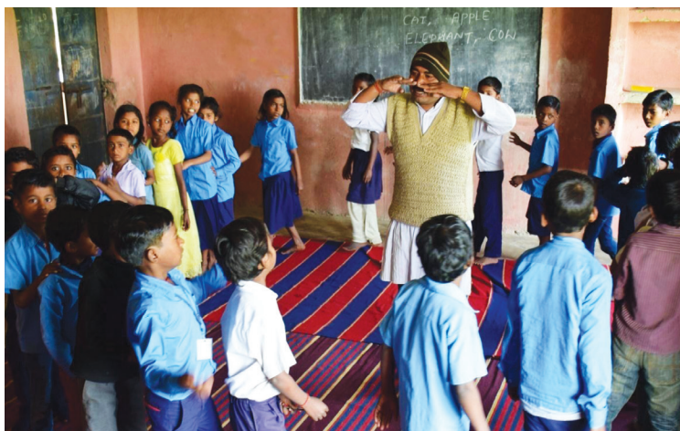
Children and teacher immersed in ABL activities

results and the interest it generated among children we began to make our own ABL tools to strengthen the process”.