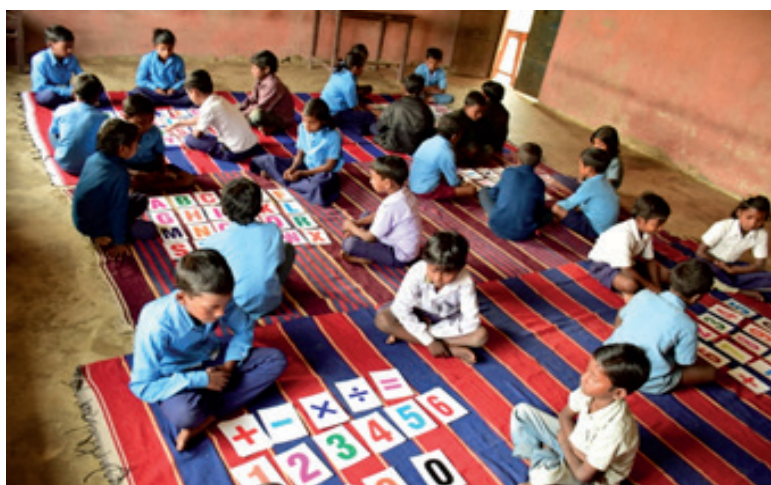
Students engaging in ABL activities