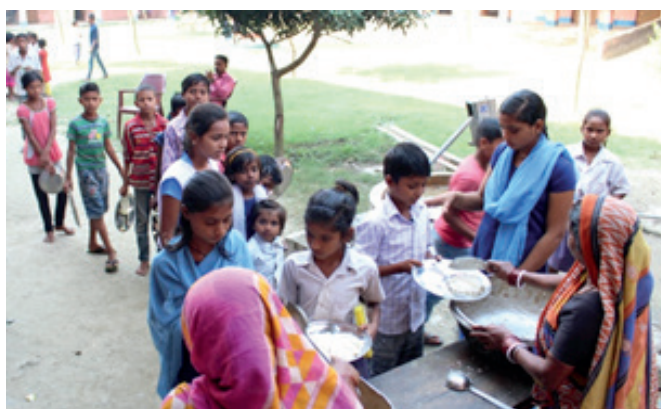
Streamlined Mid-day Meal

To ensure smooth and effective educational activities in schools, it is essential that all government schemes and programmes that cause students to flock to schools continue to be operated effectively. This includes the provision of school infrastructure, if inadequate, like the building of toilets for both boys and girls and keeping them operational, regular provisions of MDMs and the timely availability of free textbooks in schools. Deshkal Society staffs functioned