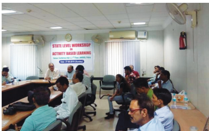
Participants at the state workshop in Patna

Stakeholders shared their experiences and noted that children are increasingly engaged with the ABL tools provided by Deshkal Society. A teacher remarked, “The way children are engaged in the classrooms has created a very positive atmosphere in the schools. Now it is up to the teachers to take it forward and make the schools children friendly and the most happening place”.