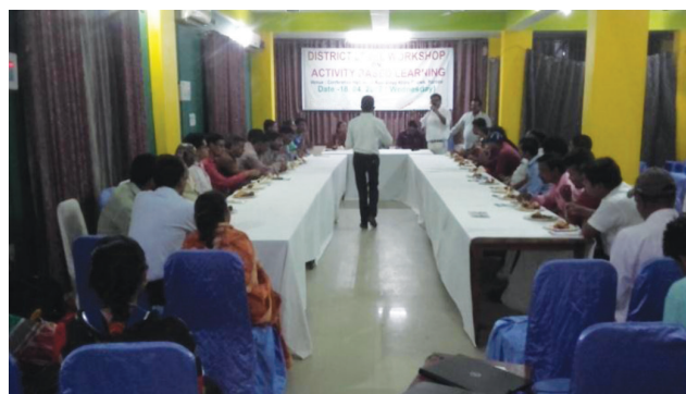
District workshop in Purnia

A District Level Workshop on ABL was organized on 18th April 2018 at Hotel Ravi Vinay, Purnia. The workshop was attended by teachers, headmasters, CRC co-coordinators, BRC co-coordinators, university teachers, and other stake holders, including community members. In all, 49 persons participated in the workshop. In this workshop, a twenty minute video was screened on the ongoing ABL processes in various schools of K. Nagar block.