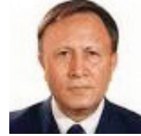
DR. SHEKHAR DUTT Author and Former Governor, Chhattisgarh, India